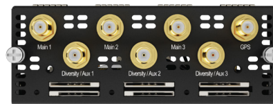
3x LTE-A Module (EXM-3LTEA)