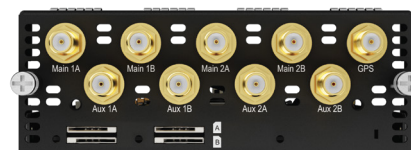
2x LTE-A Pro Module (EXM-2GLTE-G)