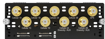
1x LTE-A Pro Module (CAT-18), 1x 5G Module(CAT-20)