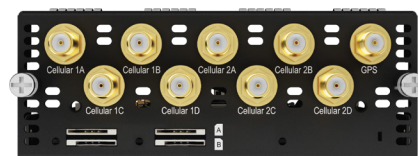
2x 5G Module (CAT-20)