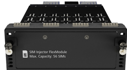
SIM Injector FlexModule (EXM-SIM-BK56)