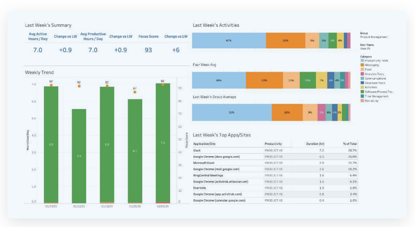
View a personal weekly summary by individual to compare trends across time horizons and activities. Use the insights as evaluation opportunities for improvement.